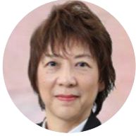
The Honourable Justice Debbie Ong Presiding Judge, Family Justice Courts