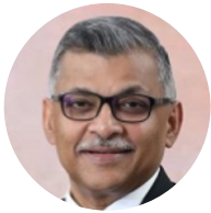
The Honourable the Chief Justice Sundaresh Menon Supreme Court of Singapore